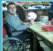
A workshop at Cheadle Royal

“Before we just had general trustees; what is working so well now is that we are using our trustees for the business skills they gained in their working life. They are proactive and the increased sales mean that we can extend the support which we offer”